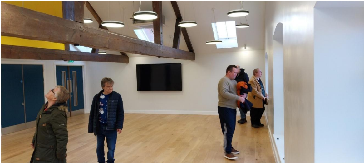
There is a fantastic large hall for exercise classes. It has old wooden beams.