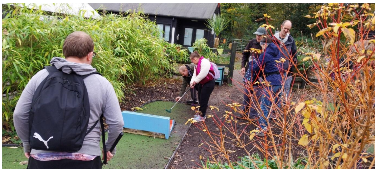
Some of us were monkeying around!