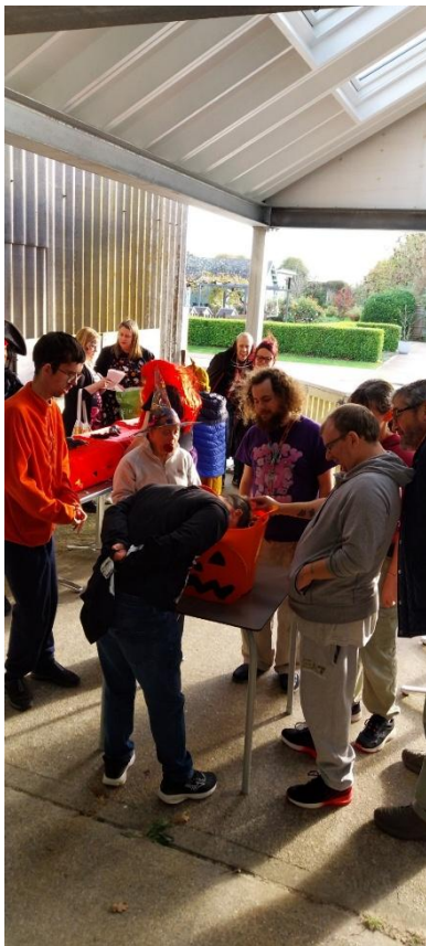
Some of us won