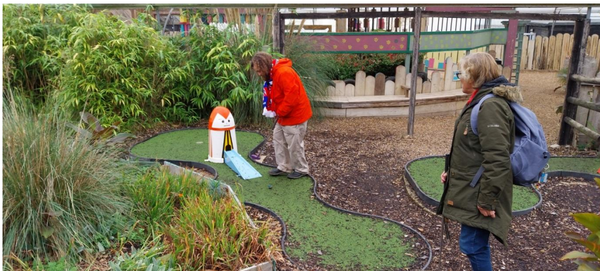
We played a little crazy golf.