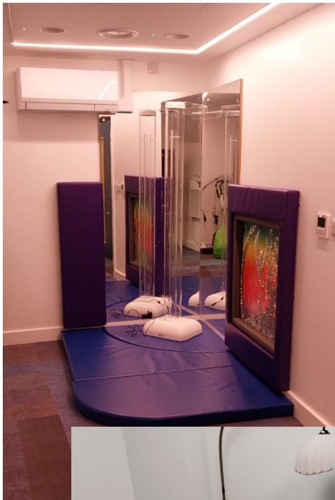
There is a chill out room and a quite space.