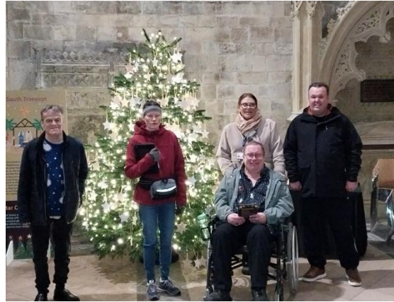
We found two Christmas trees in the cathedral.