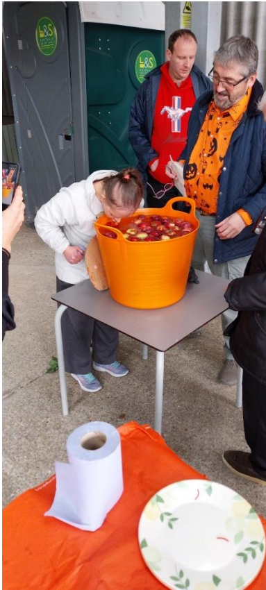
We bobbed for apples and put our hands in boxes full of creepy things!