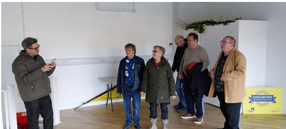
There is a room next to the café which will be opened as a shop.