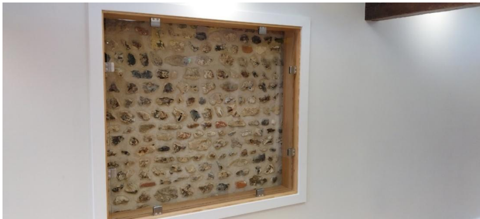
At one end of the room is a really old, flint wall.