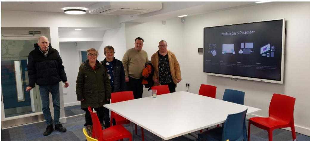
There is a meeting room.

We paid them a visit for a tasty coffee and cookie and to have a look around.