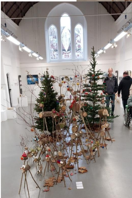
The last thing we did was to visit The Oxmarket Art Gallery where we saw this display of reindeer and Christmas trees.