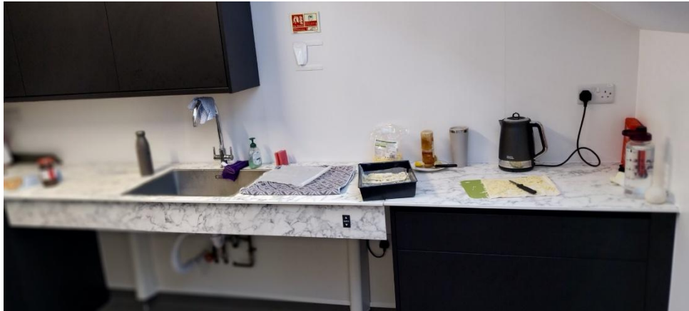
In the kitchen we caught them making pizza!