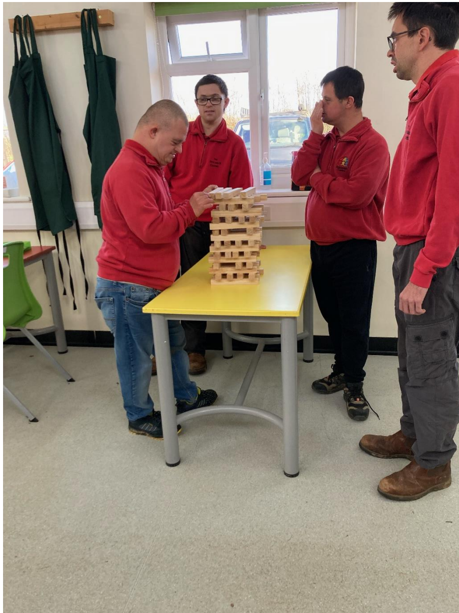
They love playing games and doing puzzles.