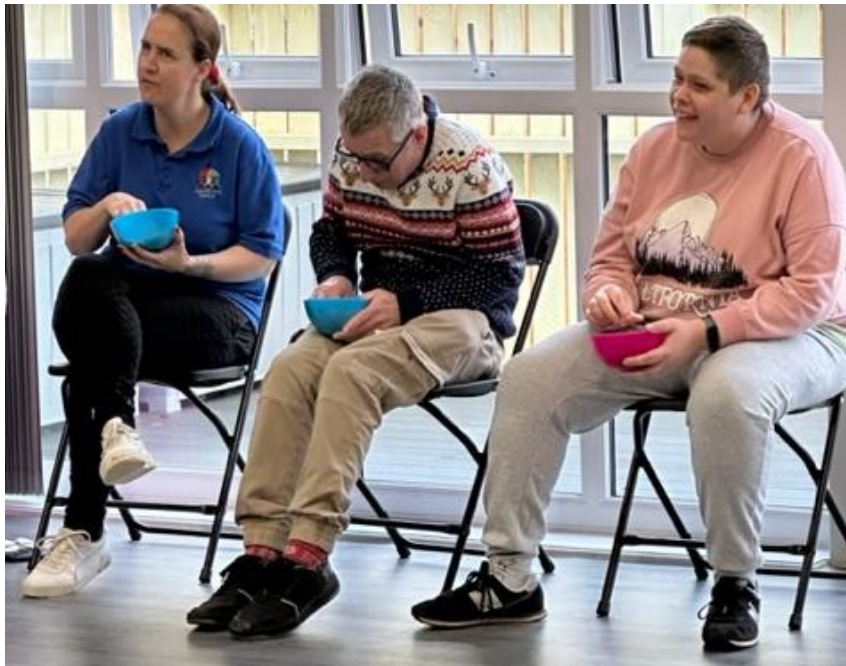
Some people had to do the "Bush tucker trial"!