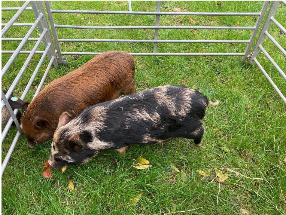
We loved the pigs!