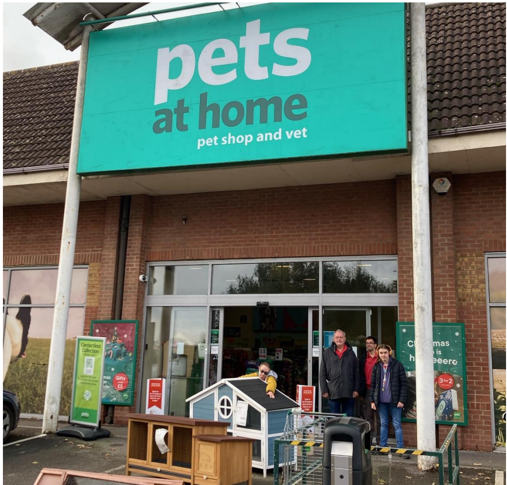
The cat food procurement team

Marley, as you know, won the award for the best cat colleague and part of the prize was a gift card to buy cat food. In order to spend this we sent a team to Pets at Home in Chichester. We had fun looking around the shop!