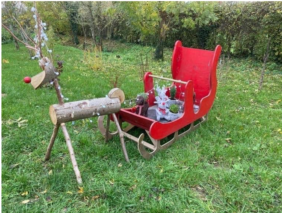
Santa parked his sleigh on the grass!