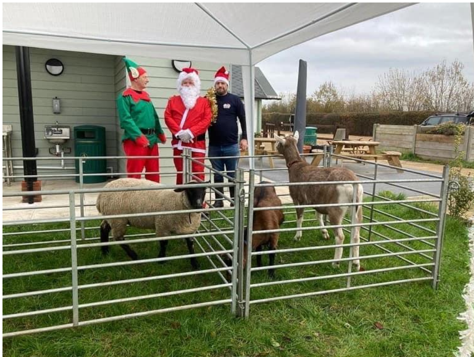
There were some farm yard animals.