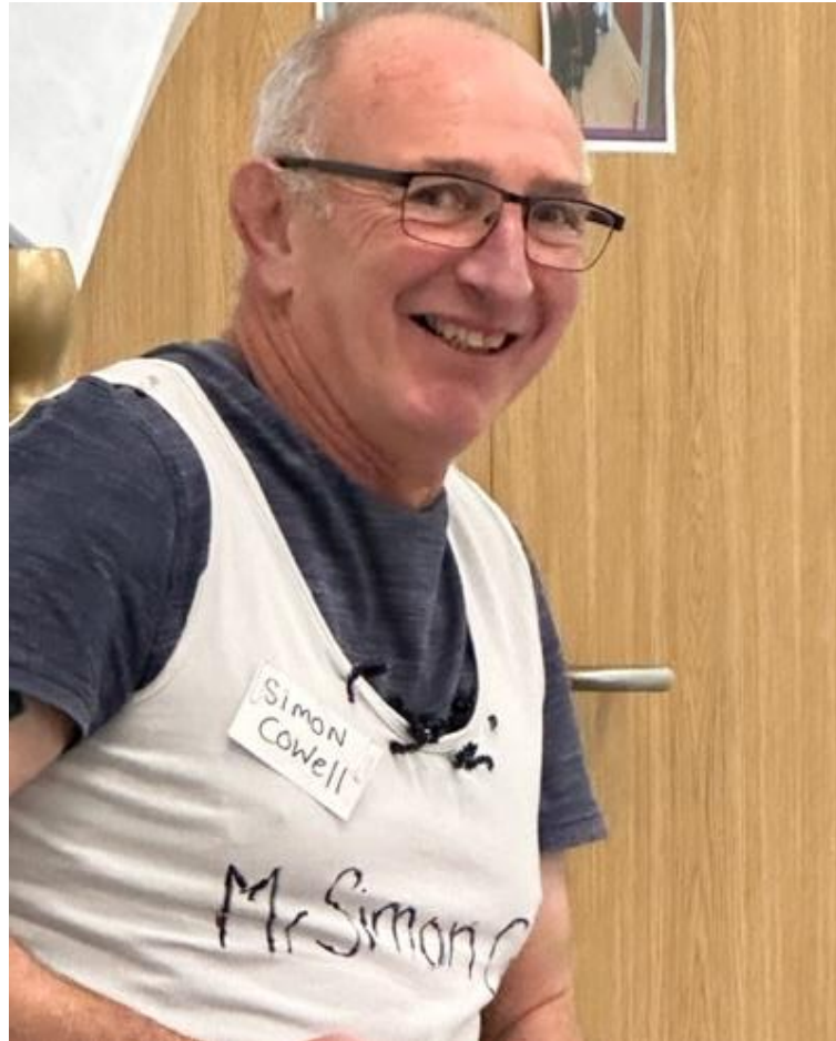
Sim Cowell turned up to judge!