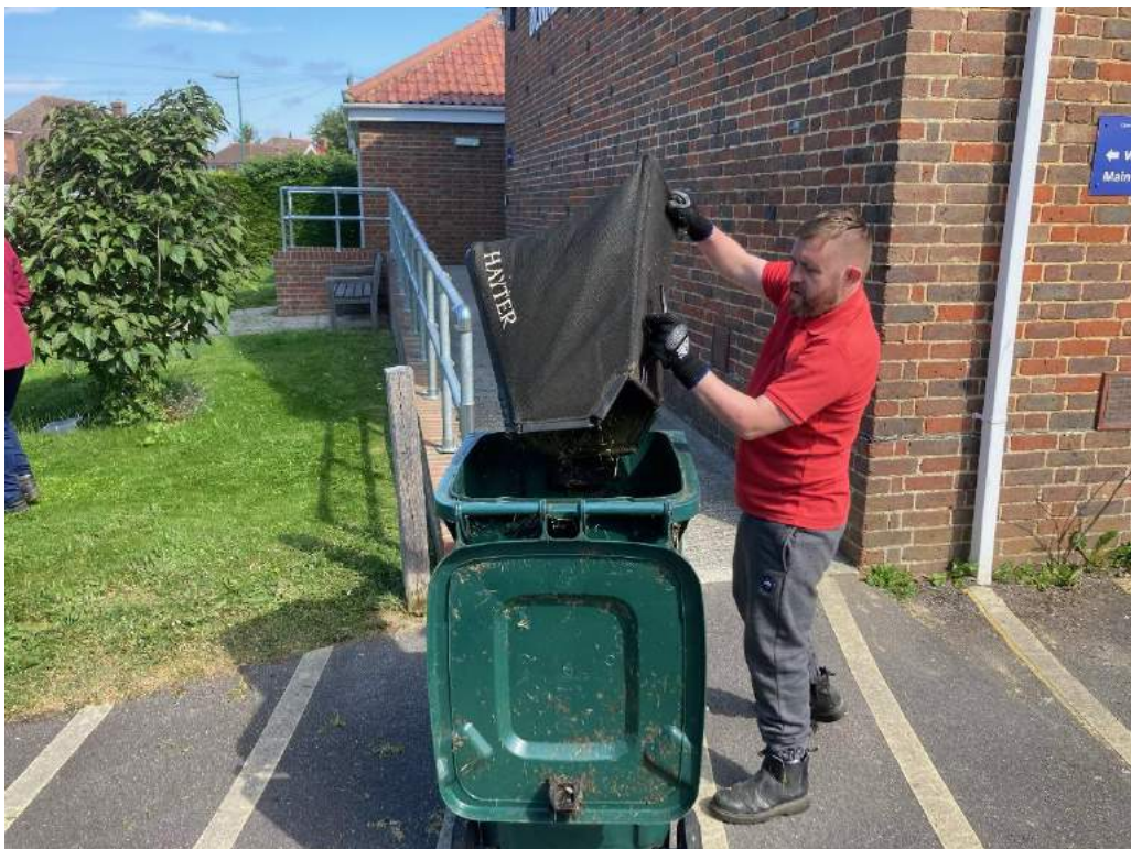
They put the cuttings into a green bin.

“Where’s yer bin?” Answer : “I’ve been cutting grass”