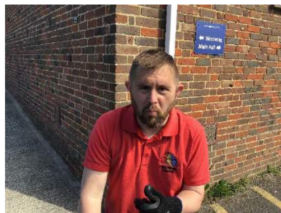
They cleared the car park and then set off back to the Centre!