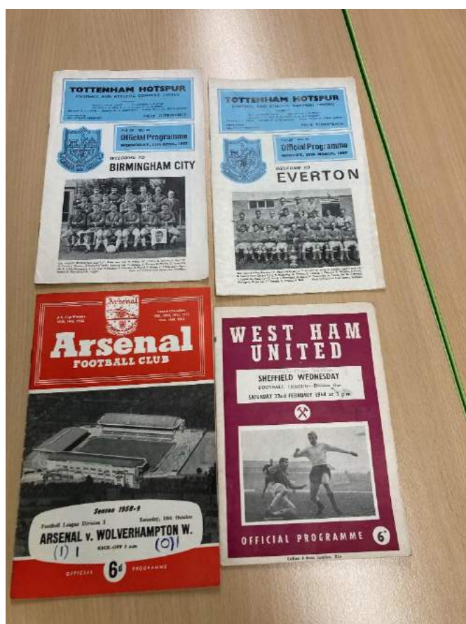
There were all sorts of old programmes.